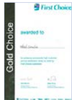
FIRST CHOICE – GOLD CHOICE