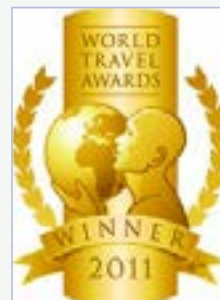
WTA – Europe's Leading Golf Resort