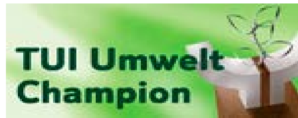
TUI – Environmentally Friendly TOP 100 Hotels Worldwide