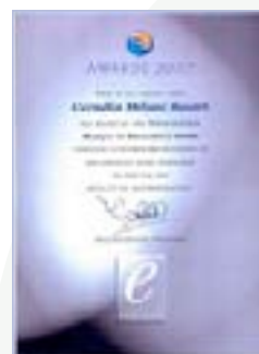
THOMAS COOK - MARQUE of EXCELLENCE