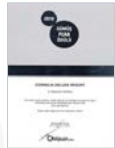
OTEL PUAN – SILVER AWARD