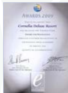
THOMAS COOK - AWARDS for EXCELLENCE