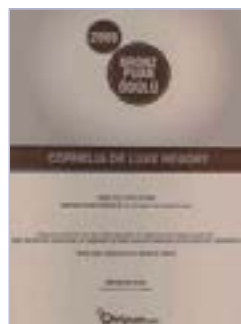
OTEL PUAN – BRONZE AWARD