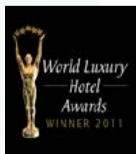
BEST LUXURY COASTAL RESORT