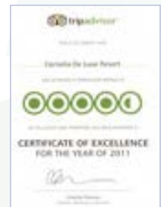
TRIPADVISOR – CERTIFICATE OF EXCELLENCE