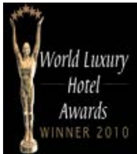
BEST LUXURY COASTAL HOTEL