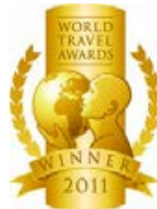
WTA – Turkey's Leading Golf Resort