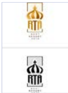
RUSSIAN TRAVEL AWARDS – Best Resort